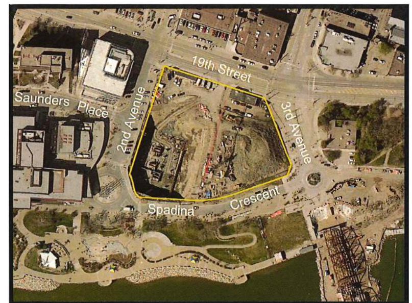
2017 AERIAL PHOTOGRAPHY