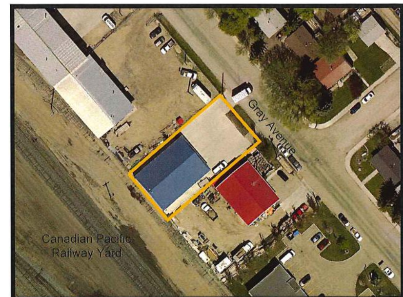
2017 AERIAL PHOTOGRAPHY