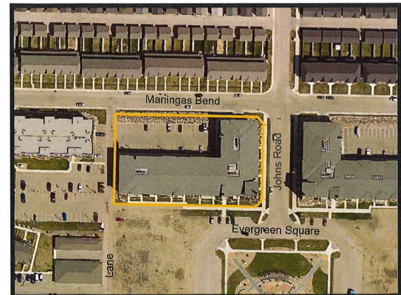
2017 AERIAL PHOTOGRAPHY