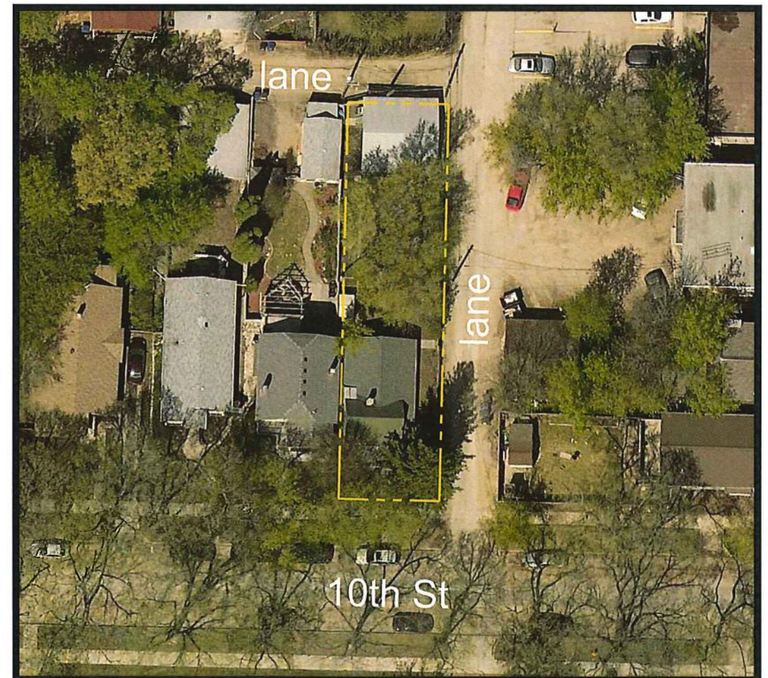
2017 AERIAL PHOTOGRAPHY