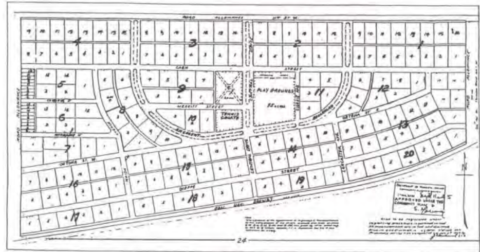
Plan of Montgomery Place subdivision by Underwood and McLellan, 1942.

Canadians who served in the military during the First World War encountered a great deal of difficulties establishing themselves upon returning home, even though the government had implemented measures for their care, including pensions, land acquisition and insurance. Veterans began to find themselves lost in transition and expressed the feeling of being left to fend for themselves.