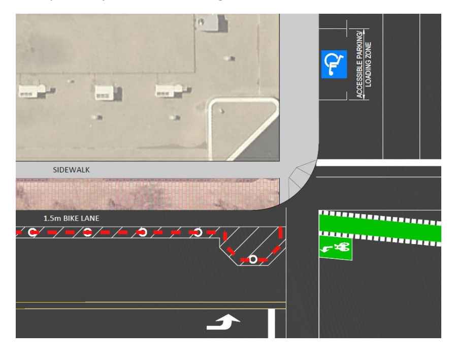
Example 3: Adjacent Block Parking

Accessible parking space on adjacent block: