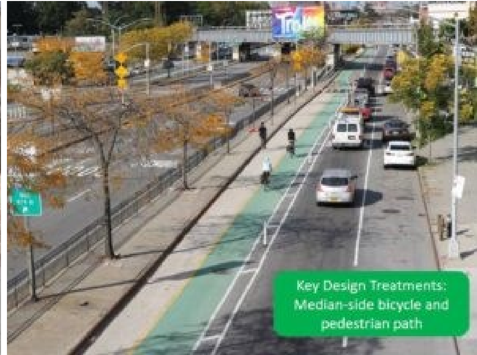
Queens Boulevard, New York, New York, USA