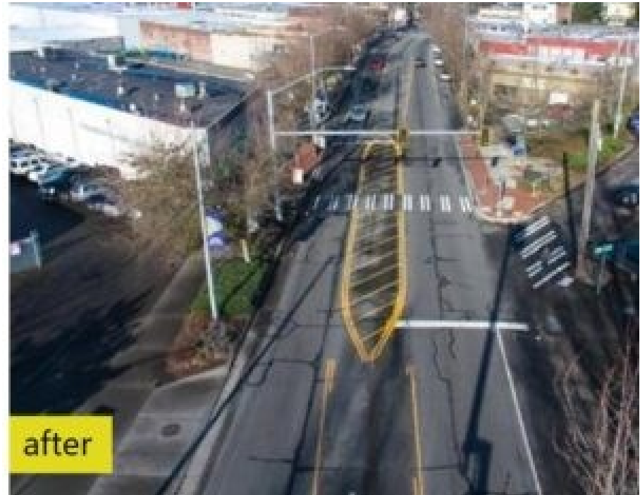
Rainier Avenue South, Seattle, Washington, USA