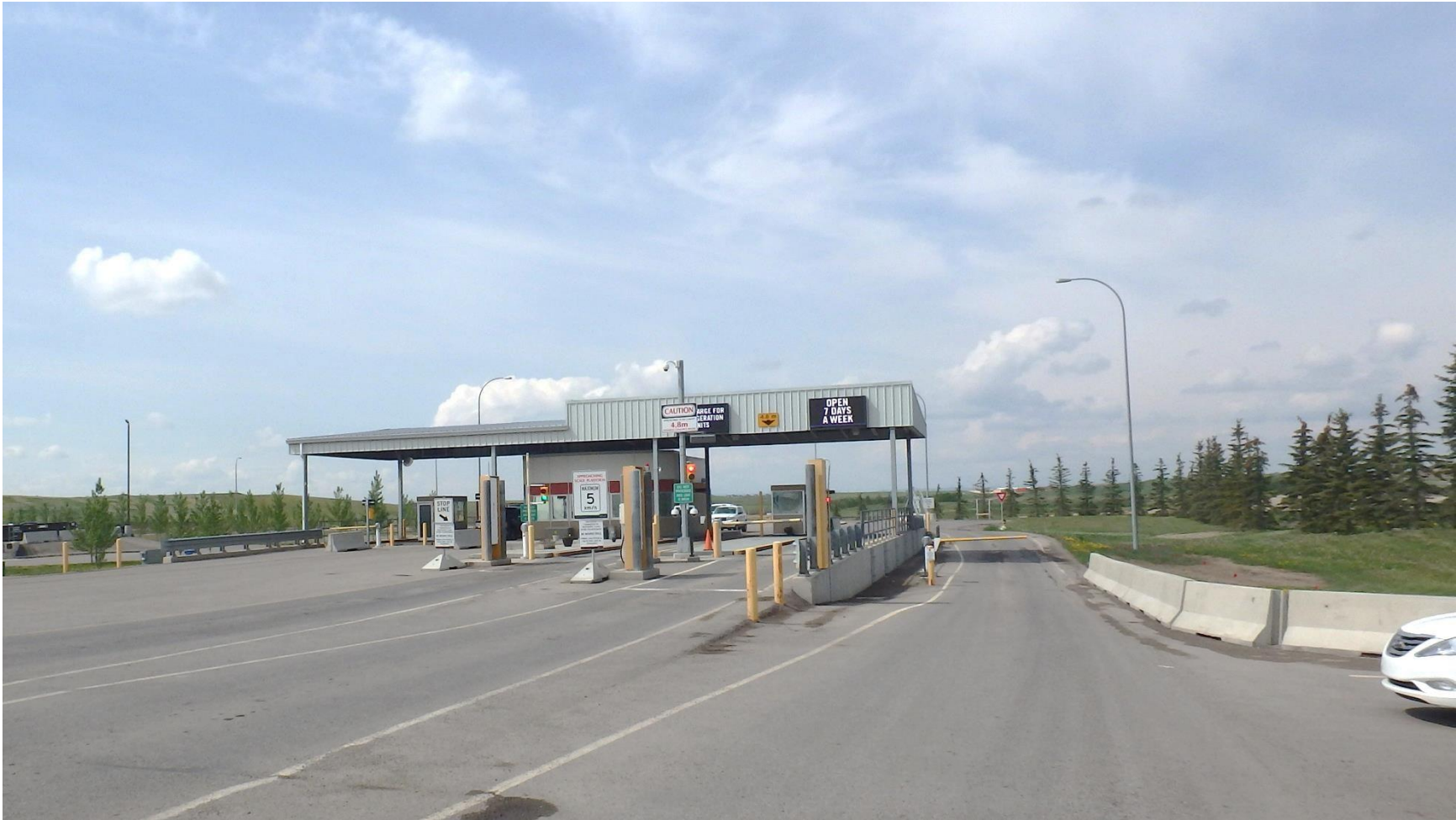
Shephard Landfill Scales (South Calgary, similar to East Calgary Scales)