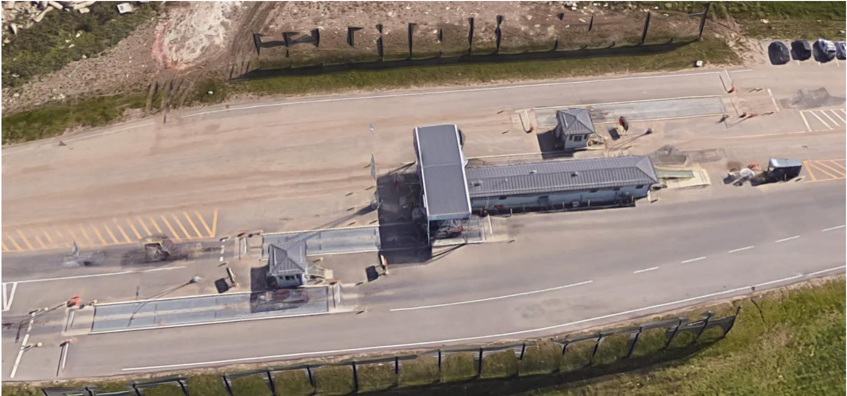
New Regina Landfill Scale System