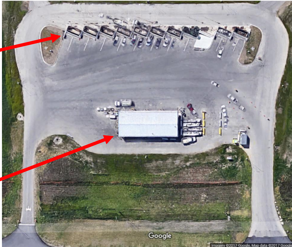
East Calgary Throw and Go