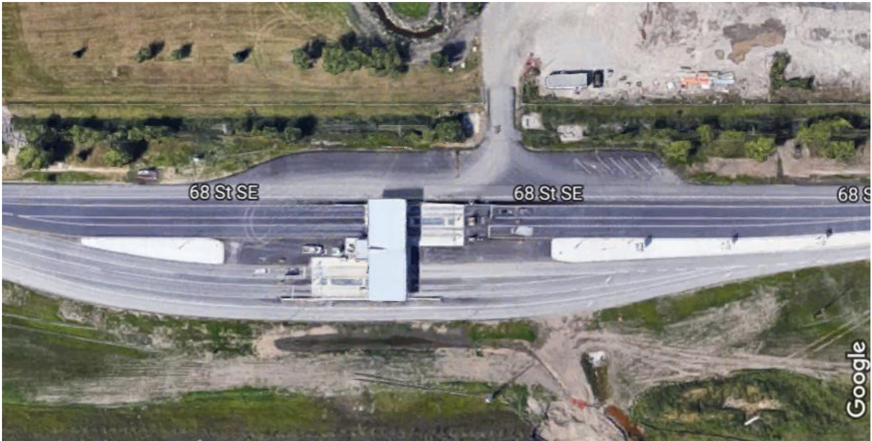
East Calgary Scales