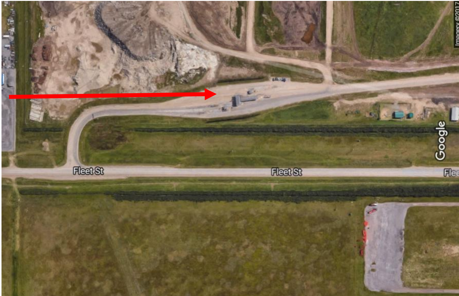
New Regina Landfill Scale System ($7.5M in 2013)