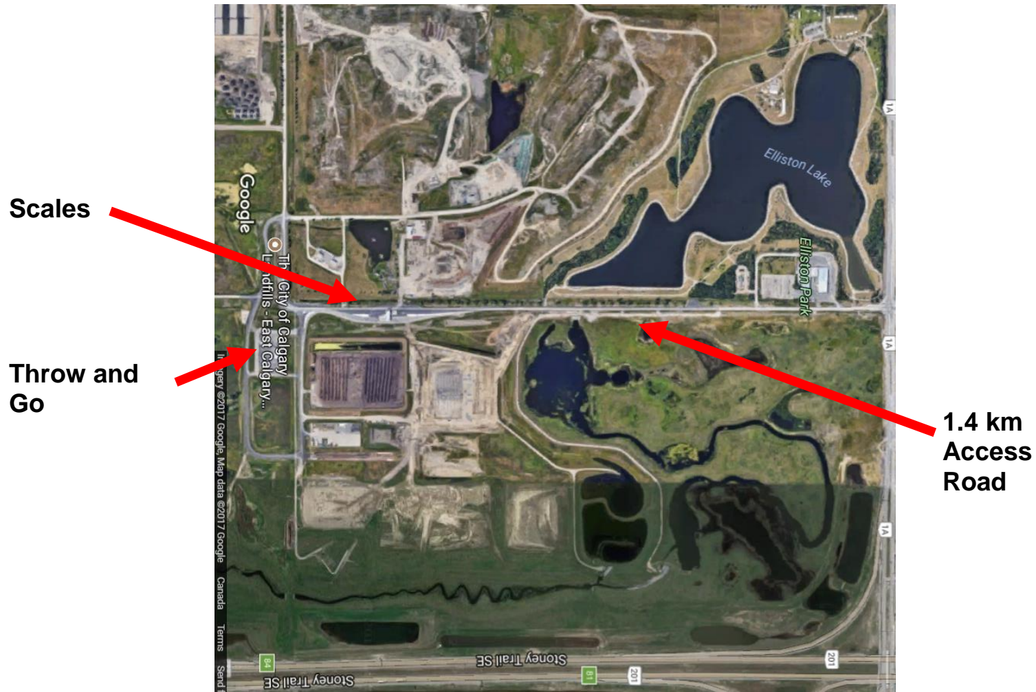
City of Calgary, East Calgary Scales and Throw and Go ($16M in 2012)