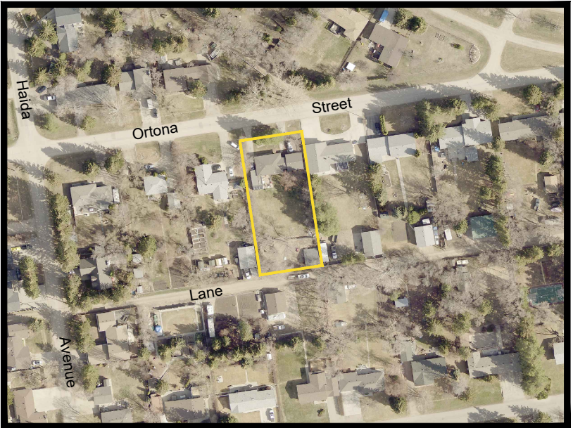
2023 AERIAL PHOTOGRAPHY