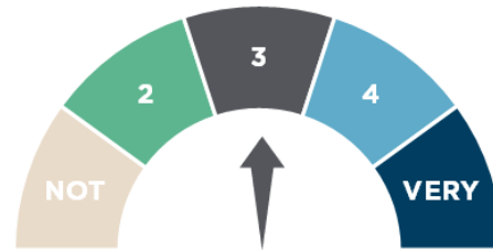
Figure 2: How confusing is the City's property tax process

Other topics suggested by respondents included the following: