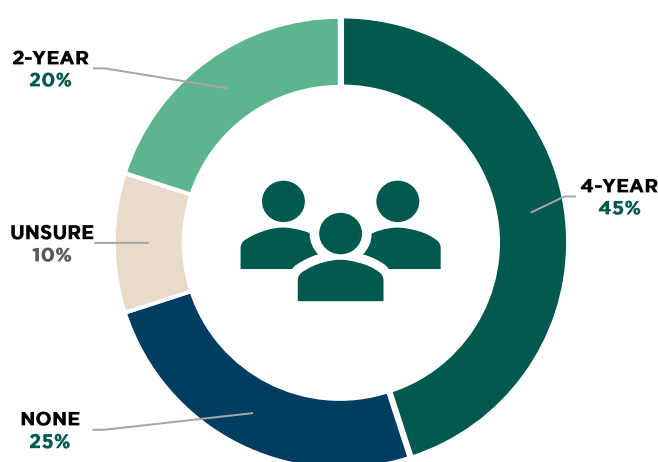
Figure 1: Phase-in preference for the 2025 property reassessment cycle