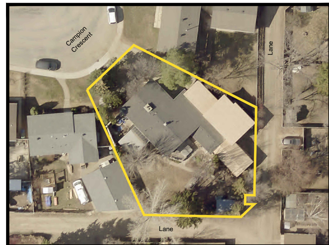
2023 AERIAL PHOTOGRAPHY