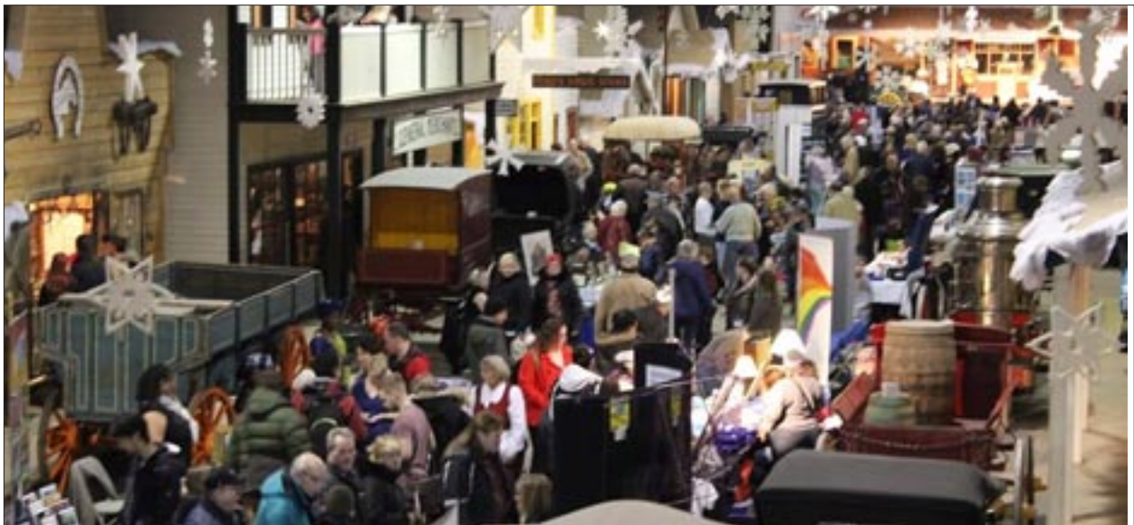
The main floor of the Saskatoon Heritage Festival 2022, at the Western Development Museum.