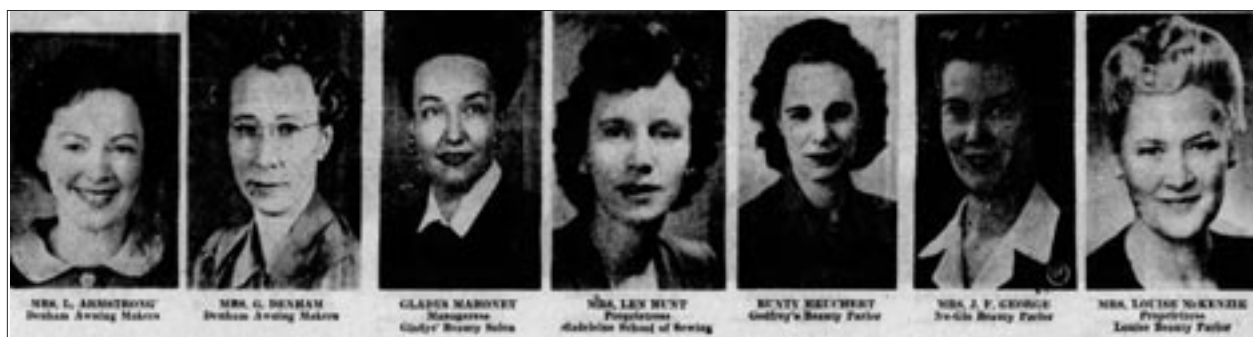
Pictures of women entrepreneurs taken from issues of the Saskatoon Star-Phoenix.