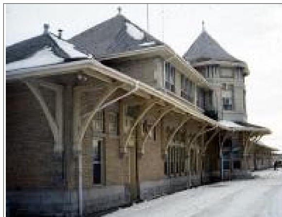
Rear view of the CPR Station Building, north side.