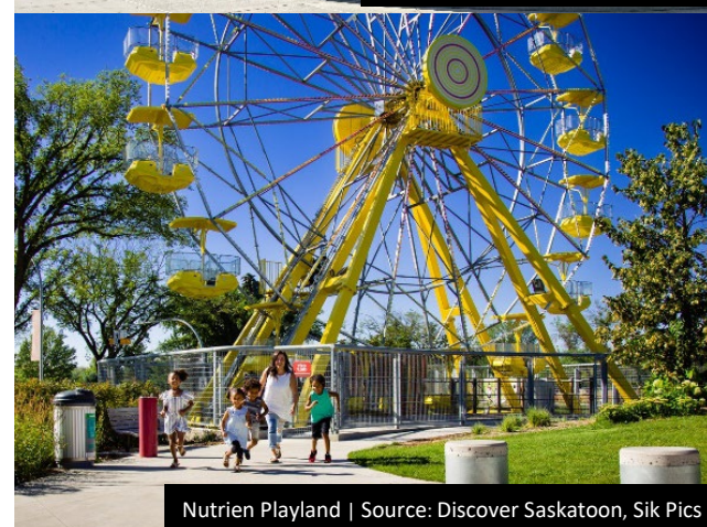
Nutrien Playland