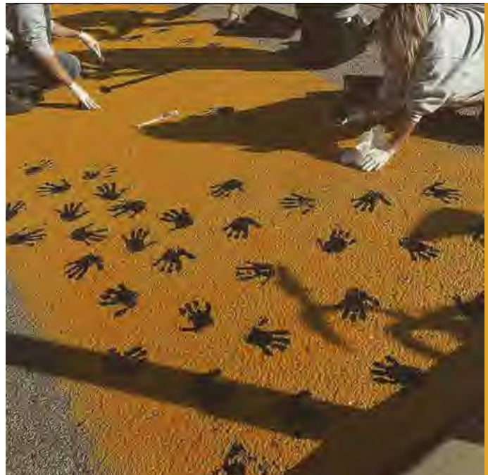
Image 4: Build Up crew painting a mural with First Nations University for the National Day for Truth and Reconciliation.