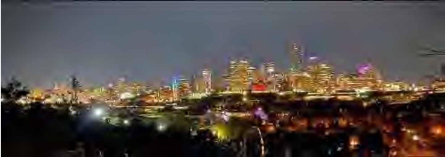
Edmonton Lights, Nicole Wolfe