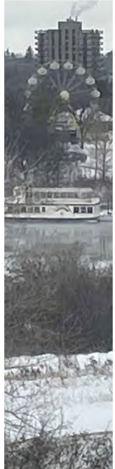
Wheels stop turning Robert Grant