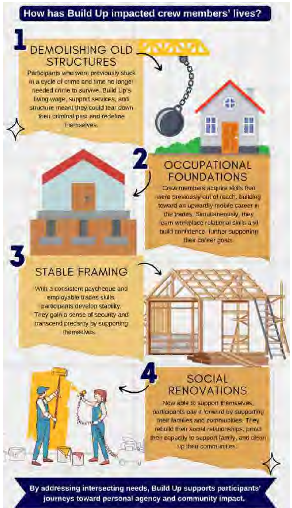
Figure 1: Themes of Build Up Crew Experiences