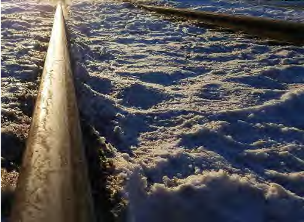
staying on track Ethan Beatty