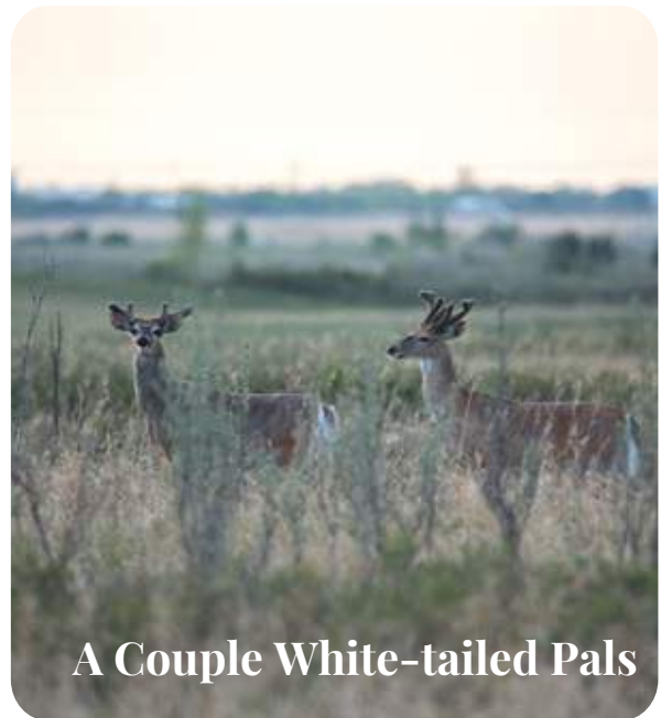
A Couple White-tailed Pals

It has also been documented that there are health risks for people living within 500 meters of a highway such as this, thus bringing harm to people who will live in neighbourhoods planned for the future.