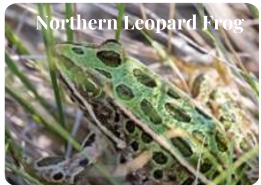
Northern Leopard Frog