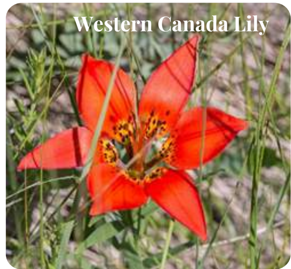
Western Canada Lily

The Swales are a refuge for plants and animals who are fast losing places to live let alone thrive.