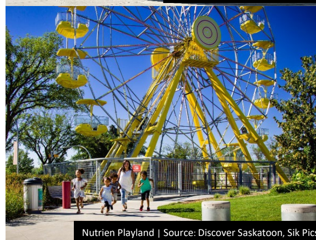
Nutrien Playland