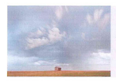
Living Skies Regional Council

The United Church of Canada in Saskatchewan www.livingskiesrc.ca