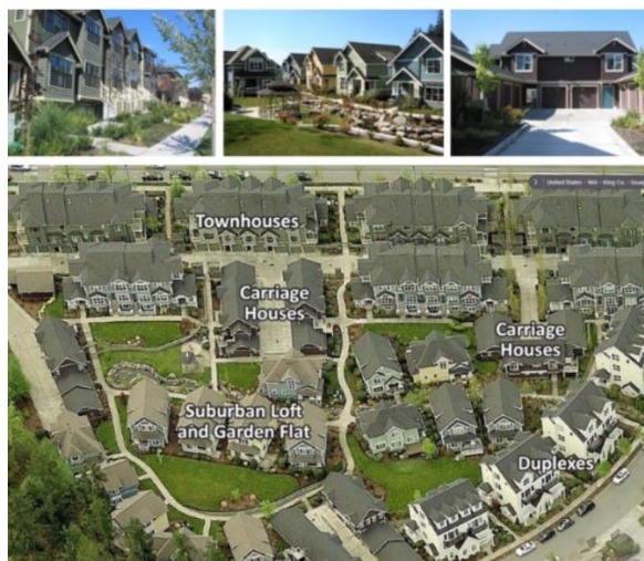
Example of 15 du/acre (Low-mid density) development providing space for Biodiversity-sensitive urban design