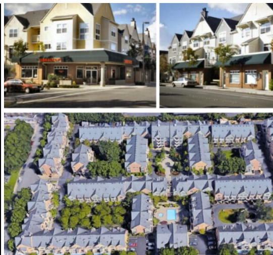
Example of 34 du/acre (Medium density) development supporting at-grade retail and mixed uses