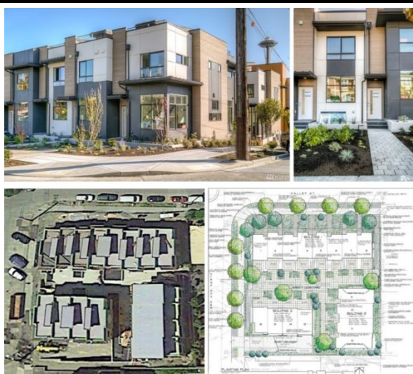
Example of a 44 du/acre (Medium-high density) development creating shorter walk distances