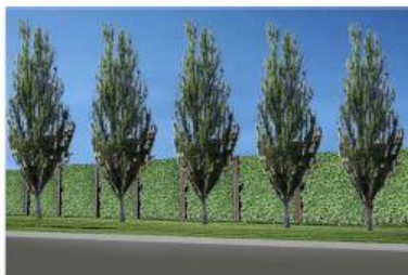
Image showing soundwall and tree screen on elevation A mature growth