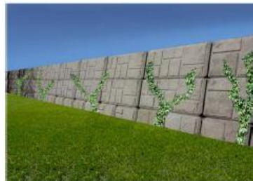
Image showing bulk bins stone wall with Virginia Creeper growing over on Elevation B, initial planting