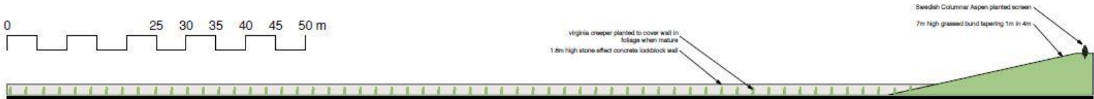
Elevation B - initial planting