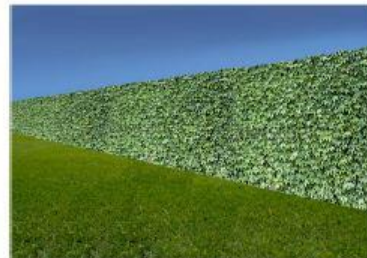
Image showing bulk bins stone wall with Virginia Creeper growing over on Elevation B, mature growth