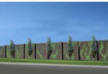
Image showing soundwall and tree screen on elevation A initial year planting