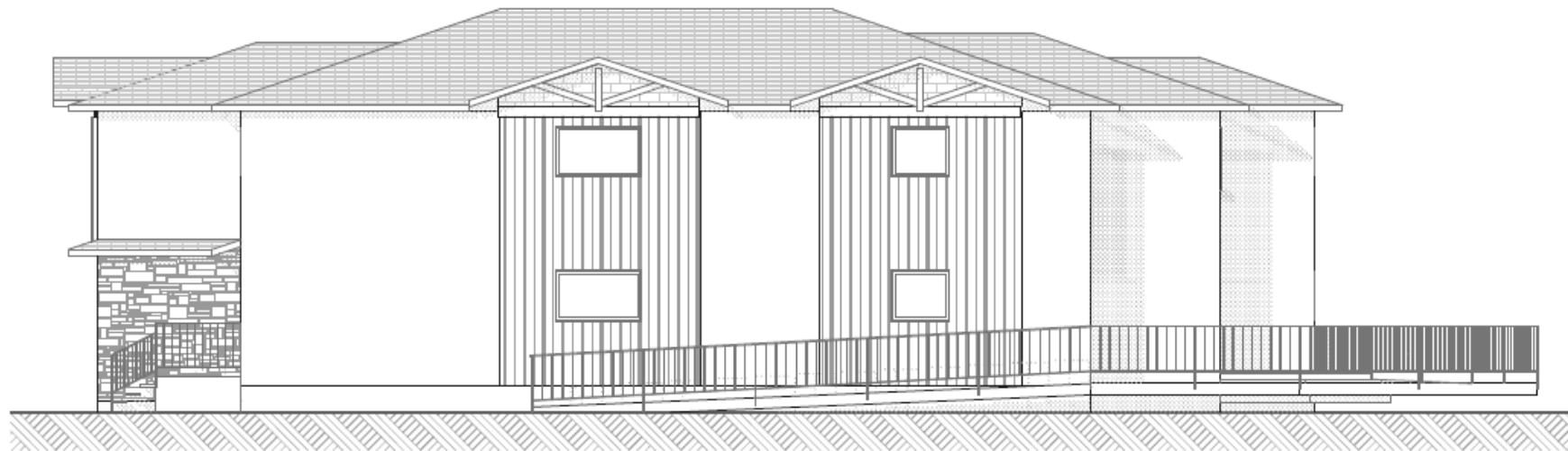
1 | E4 RIGHT ELEVATION SCALE 1/8" = 1'-0"