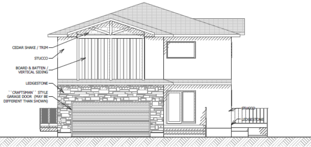
2 | E1 FRONT ELEVATION SCALE 1/8" = 1'-0"