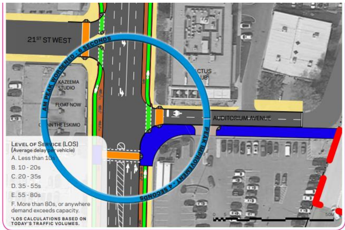
Figure 3.8 Idylwyld Drive @ 21st Street West