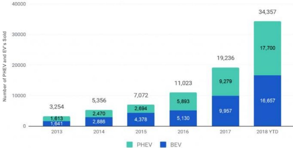
Figure 1. Annual Plug-in Hybrid EV and EV Sales in Canada. FleetCarma.

EV sales were the highest in the following provinces at the end of 2018: