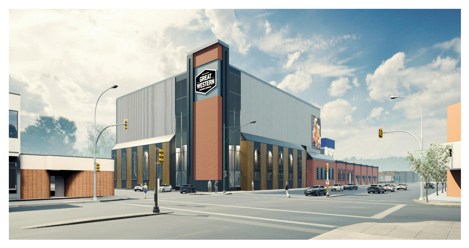
Building Rendering (viewed from 2<sup>nd</sup> Avenue North at 26<sup>th</sup> Street)