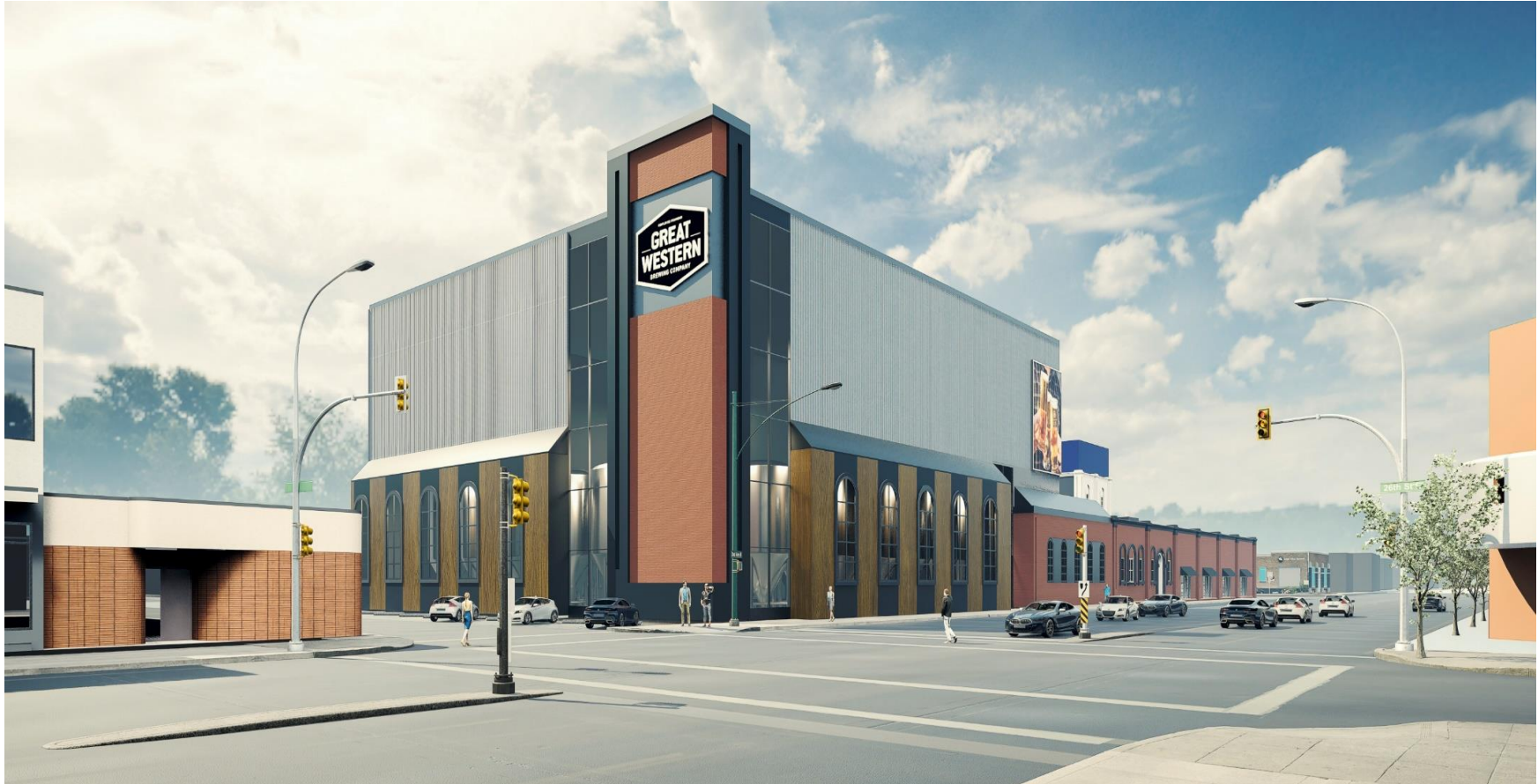
Building Rendering (viewed from 2 nd Avenue North at 26 th Street)