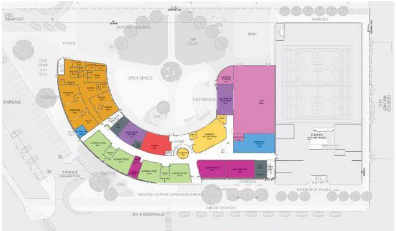
School 1st Floor Plan