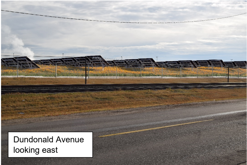
Dundonald Avenue looking east