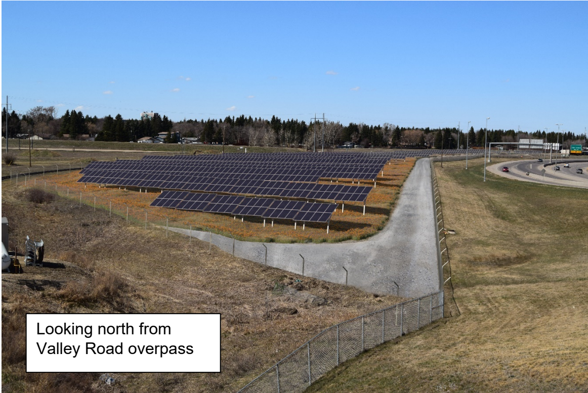
Looking north from Valley Road overpass