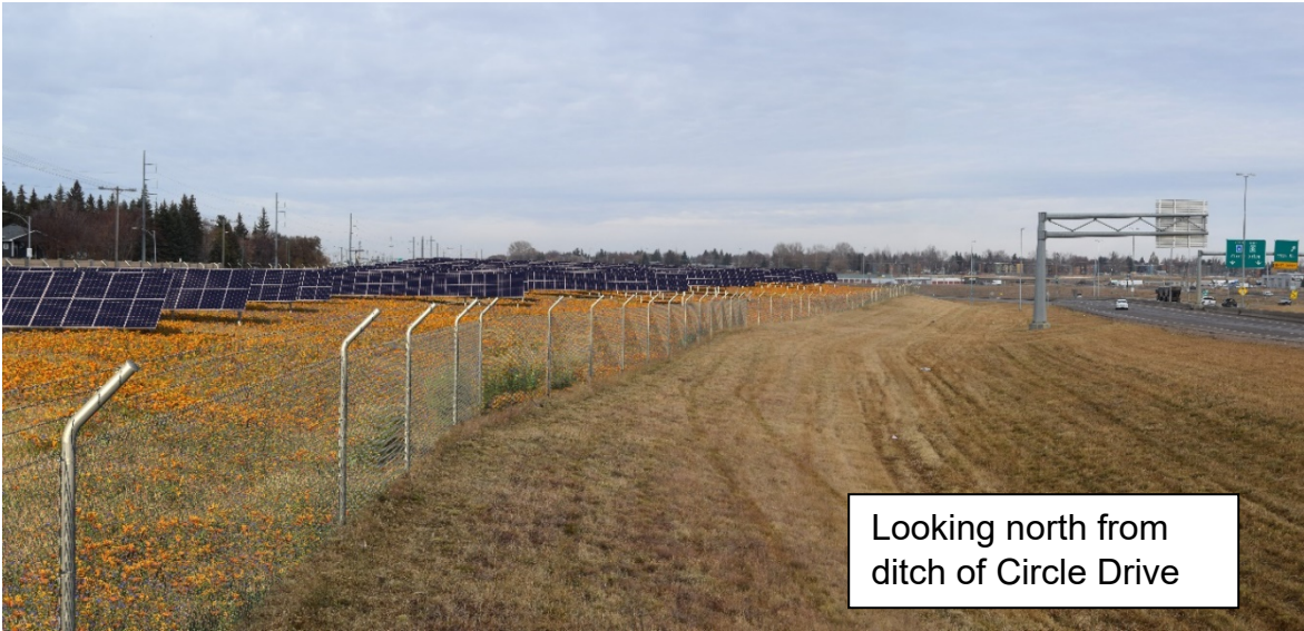
Looking north from ditch of Circle Drive