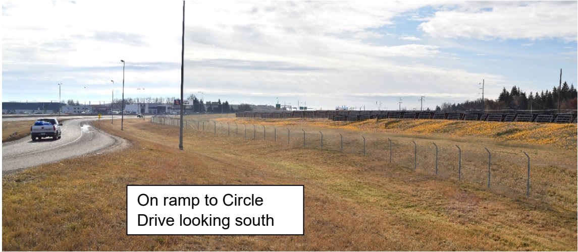
On ramp to Circle Drive looking south