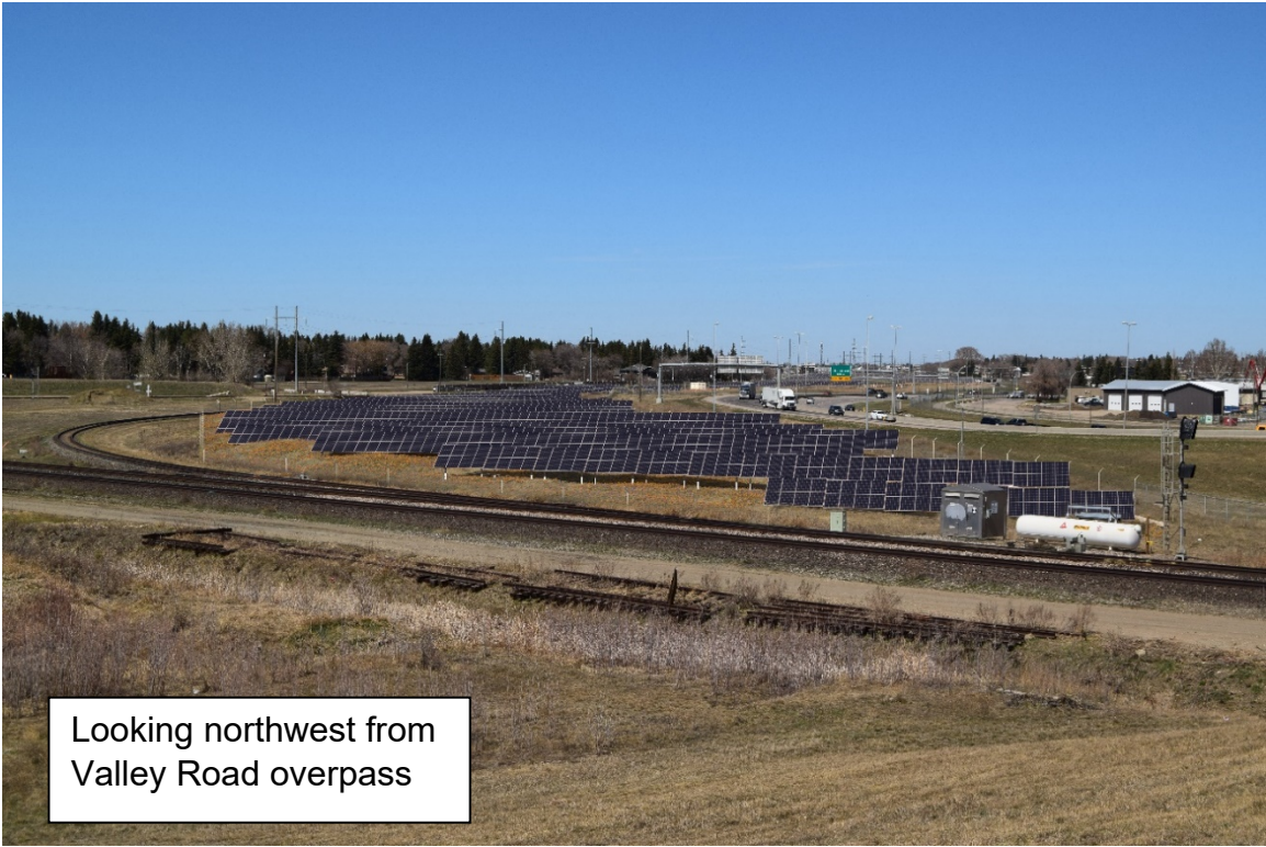
Looking northwest from Valley Road overpass