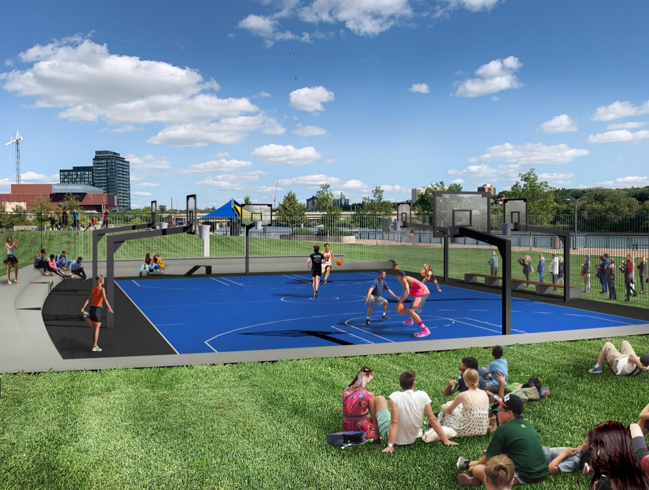
Proposed Court Mockup