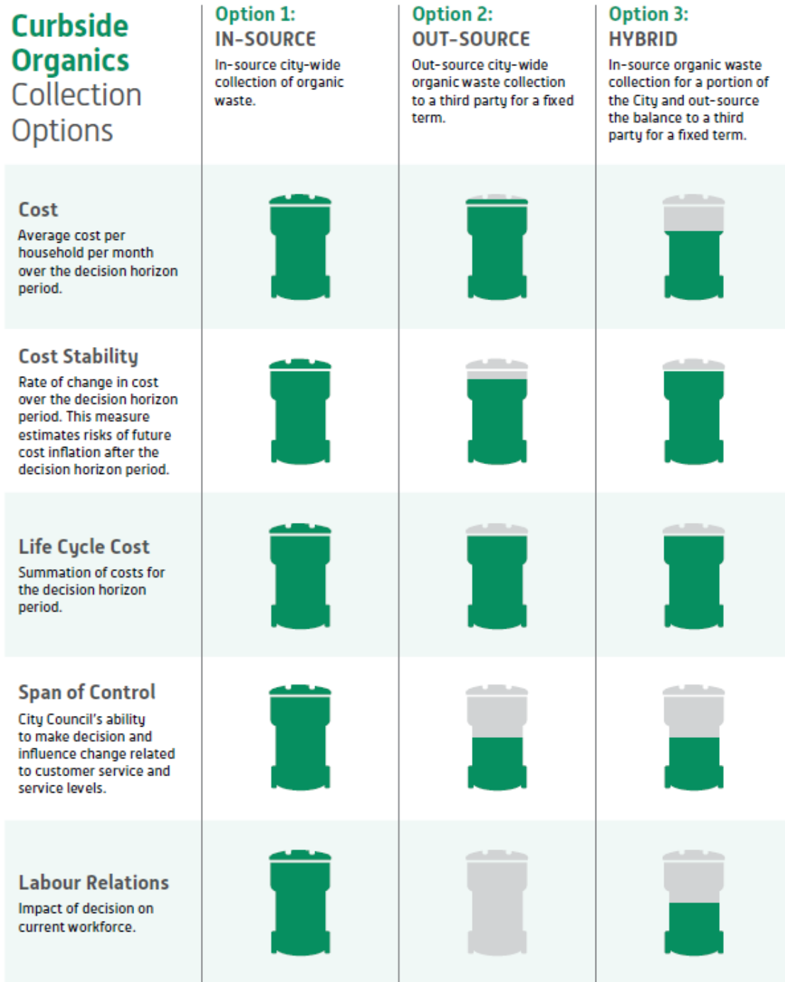
Table 1 – Curbside Organics Collections Options

The image below provides a summary of the comparison on the 3 options.