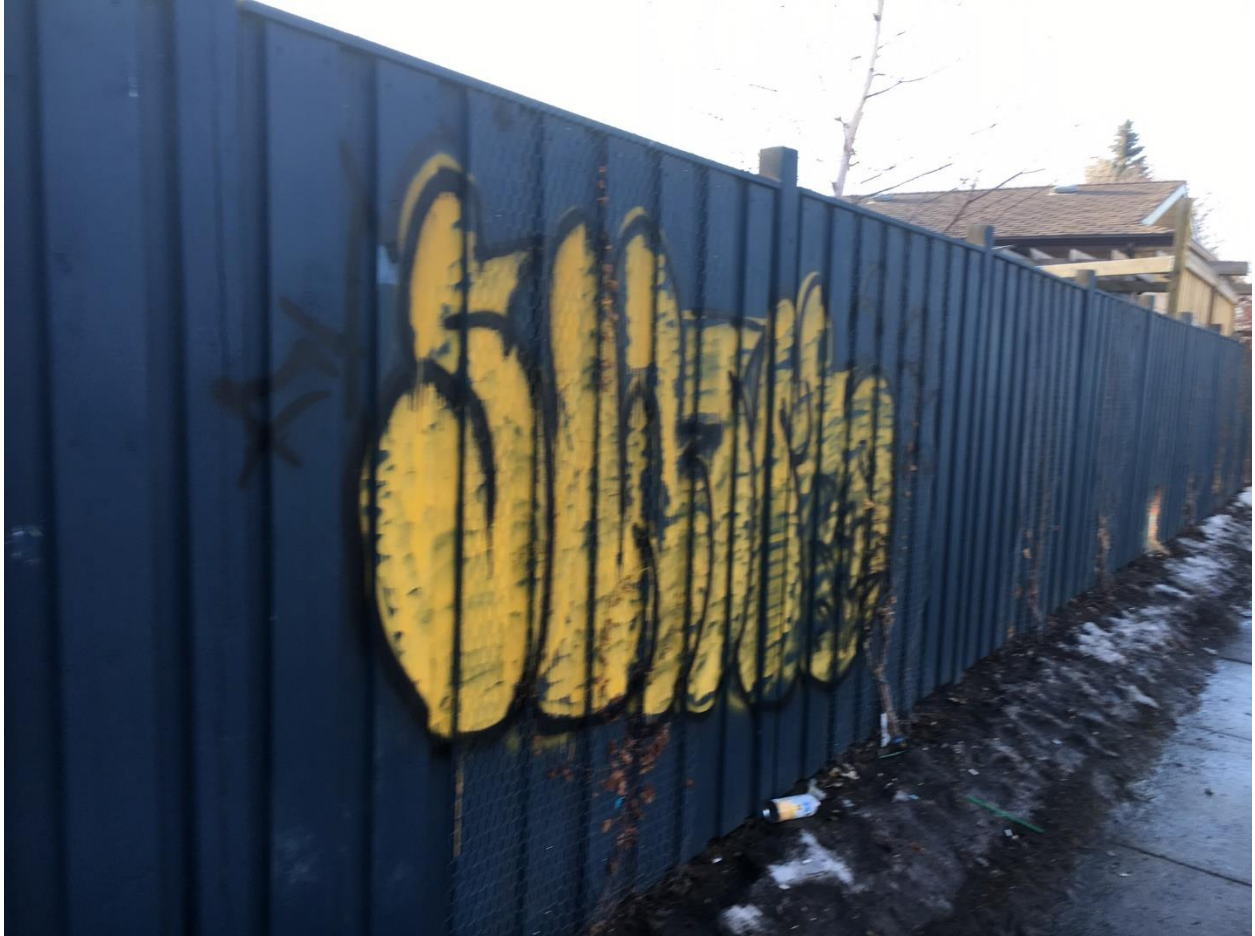
Photo: Spray painting