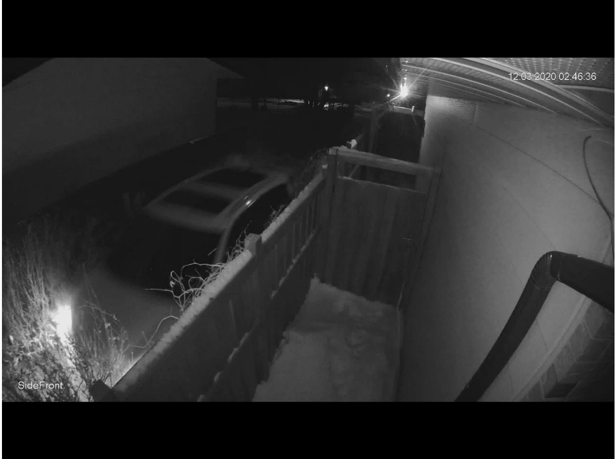
Photo: Stolen Vehicle Evading Police