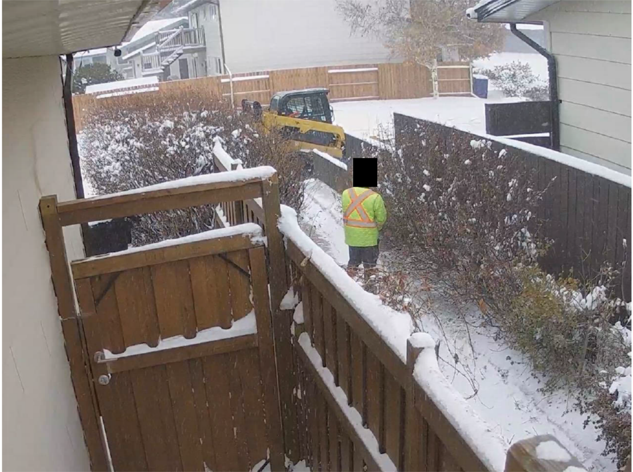
Photo: Public worker urinating