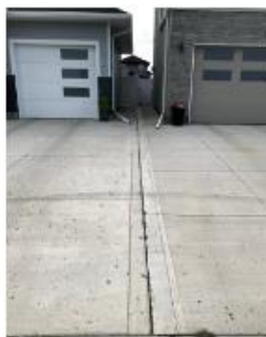
Example of matched driveway grades

Standards aimed at ensuring compliance with approved lot grading plans and mitigating adverse impacts of surface drainage.