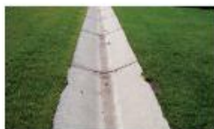
Concrete swale example