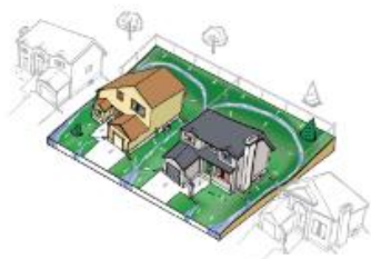
Example of back to front lot grade type

Educational initiatives aimed at assisting homeowners, builders and developers with tools to grade their lots appropriately.