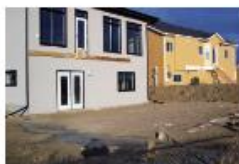
Example of walk-out home constructed on non-walk-out lot