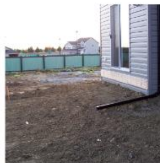
Good rough grade slope away from foundation wall below a future deck