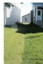
Side-yard grass swale example