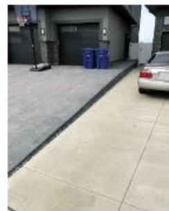
Example of front driveway grade separation