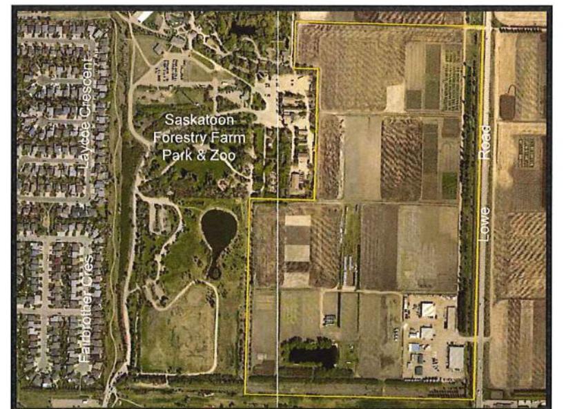
2017 AERIAL PHOTOGRAPHY