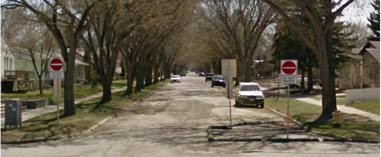
Figure 3: Street view of a permanent directional closure (facing north)