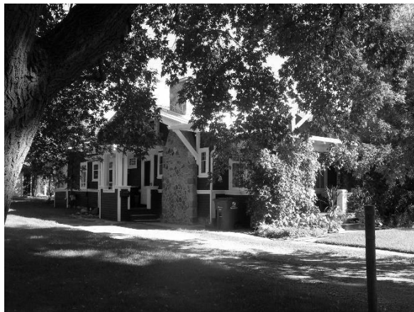
Top: Bowerman House.