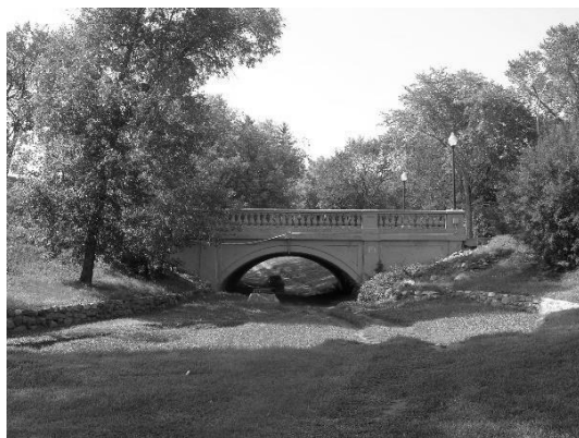
Top: Spadina Crescent Bridge.