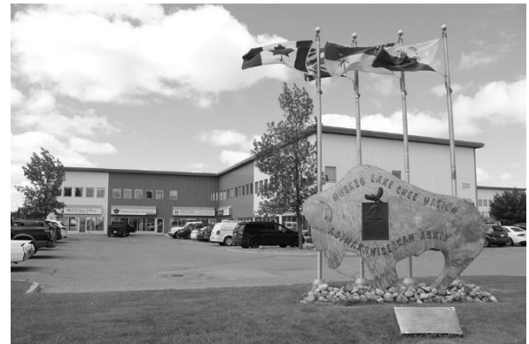
Top: Muskeg Lake First Nation Urban Reserve.