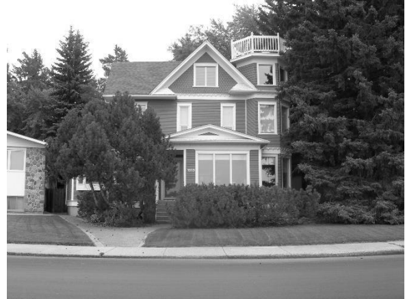
Top: Pendency House.