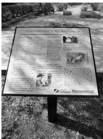
Top: Gardener's Residence Interpretive Board.