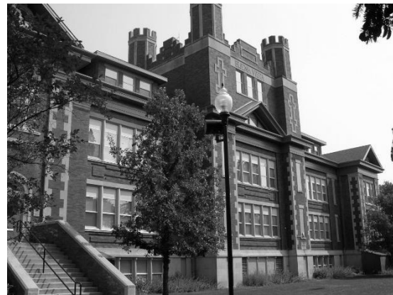
Top: Buena Vista School.