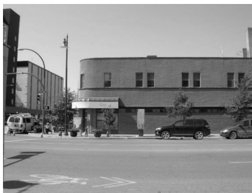
Top: Yaeger Block.