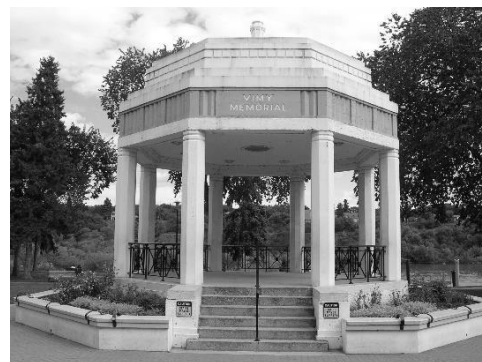
Top: Vimy Memorial Bandstand.