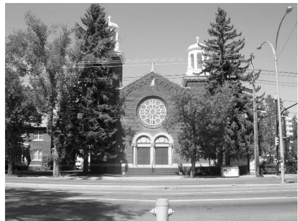
Top: St. Joseph's Roman Catholic Church and Rectory.