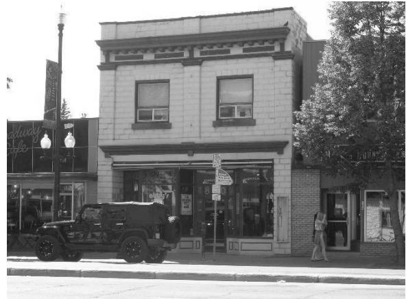
Top: Stewart's Drug Store.