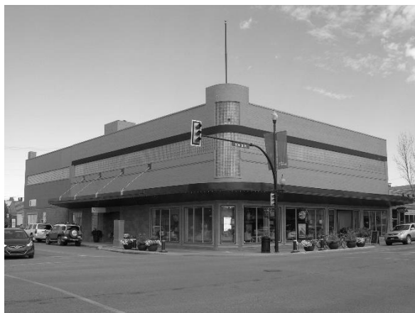
Top: Adilman's Department Store.