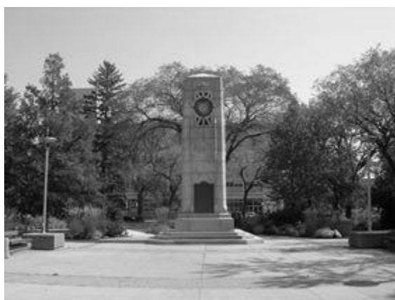
Top: Cenotaph.