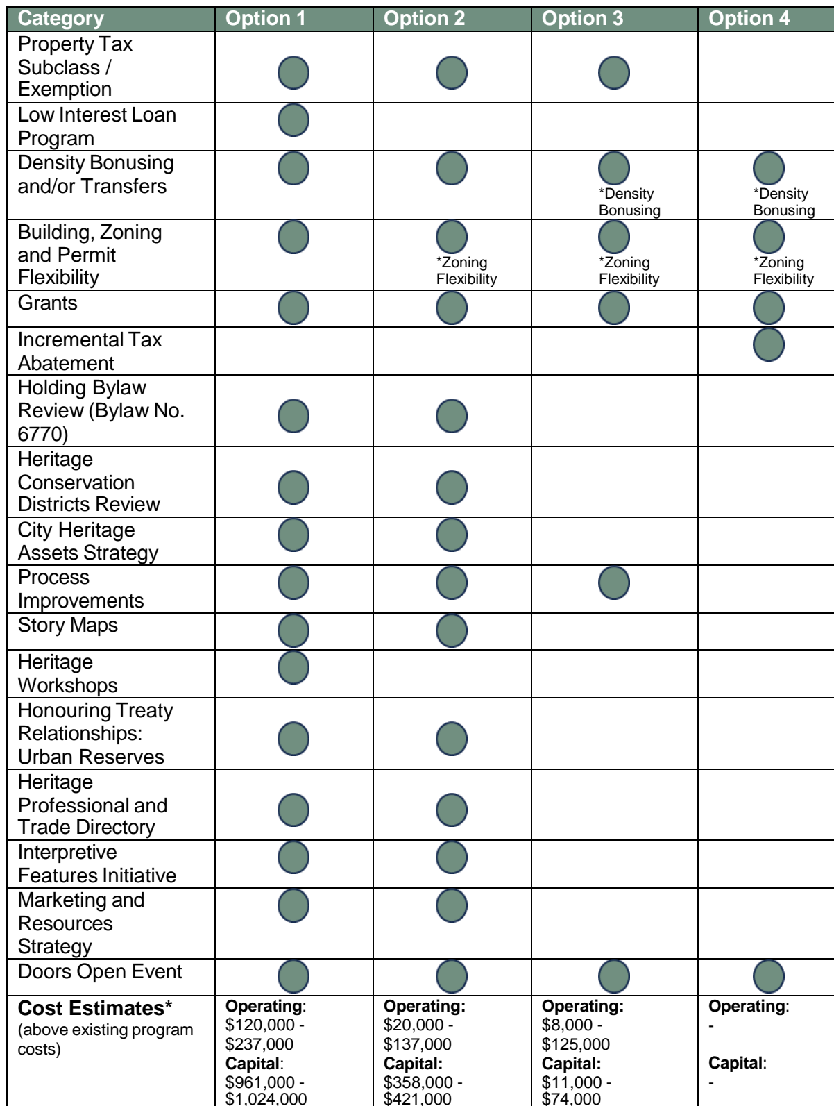
Program Options Summary Table