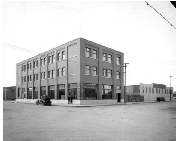
Top: City Hall Source: Saskatoon Public Library – Local History. A-1524

Providing access to education, tools and resources to heritage property owners and the public.