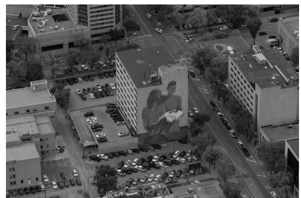
Bottom: Yellow Quill First Nation Urban Reserve.