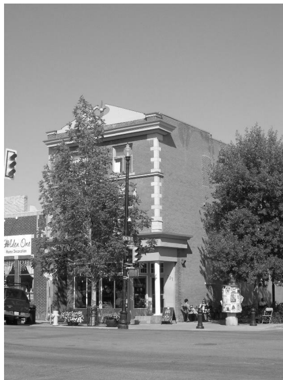
Top: Eaton Block.