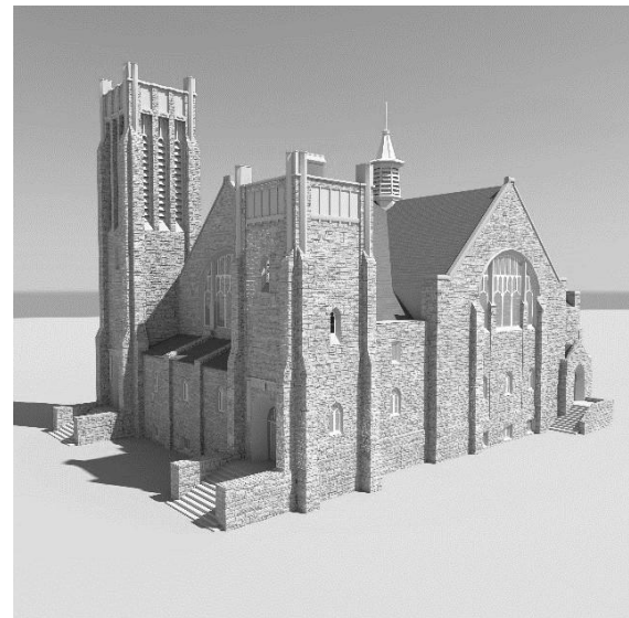
Top: 3D Model of Third Avenue United Church created in partnership with Tourism Saskatoon, Third Avenue United Church, CyArk and Stantec