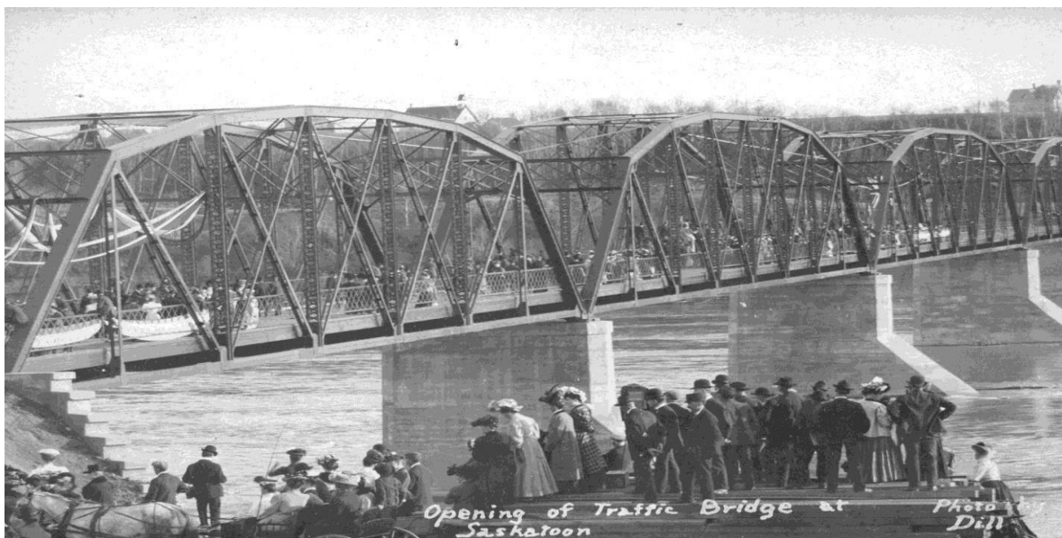
Top: Traffic Bridge. Source: Saskatoon Public Library – Local History. LH-1389

Each component is outlined in further detail on the following pages.