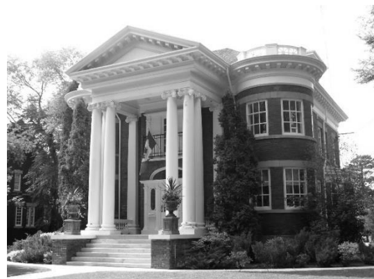
Top: Hopkins House.