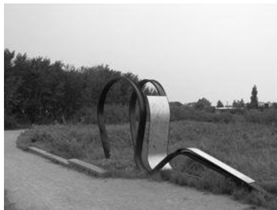
Top: Moose Jaw Trail.