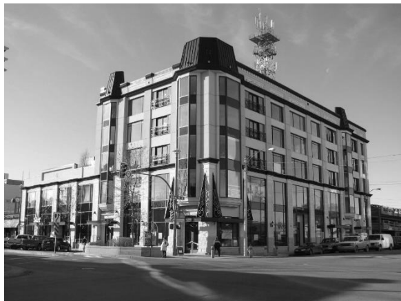
Top: King George Hotel.