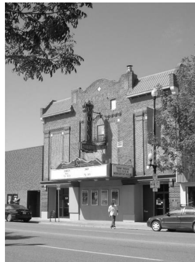
Top: Roxy Theatre.