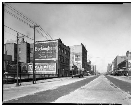
Top: 3rd Avenue South.

The number of designated Municipal Heritage Properties and the ability to support existing Municipal Heritage Properties, may continue to remain low due to lack of sufficient incentives and support. Regulation and protection will remain inconsistent, and education and resource initiatives will continue to operate at a bare minimum.