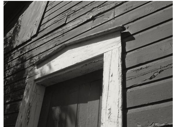
Top: Trounce House.