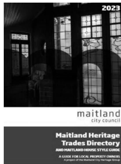
Left: Maitland Heritage Trade Directory.