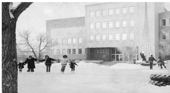
Top: City Hall

An engage page for the project was created along with a public survey requesting feedback on the proposed incentives, regulations and education options. There were 75 respondents to the survey.