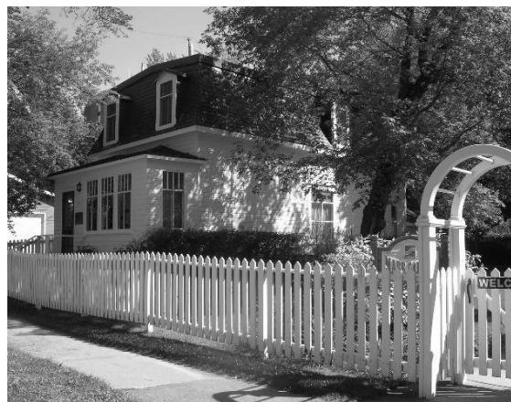
Top: Marr Residence.